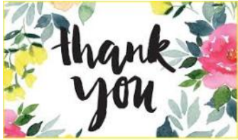
Justine is always busy!!